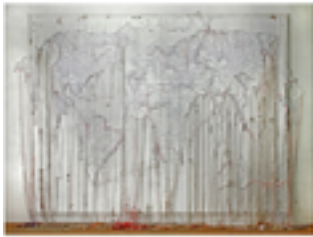
La Pangée, 2011, 200 cm x 300 cm textile, thread, paper

The use of thread is constantly being developed in the work of Brankica Zilovic. Embroidery and textile have been increasingly incorporated into her installations, paintings and drawings. Her works display an almost neural complexity that is ultimately a reflection of the world today.