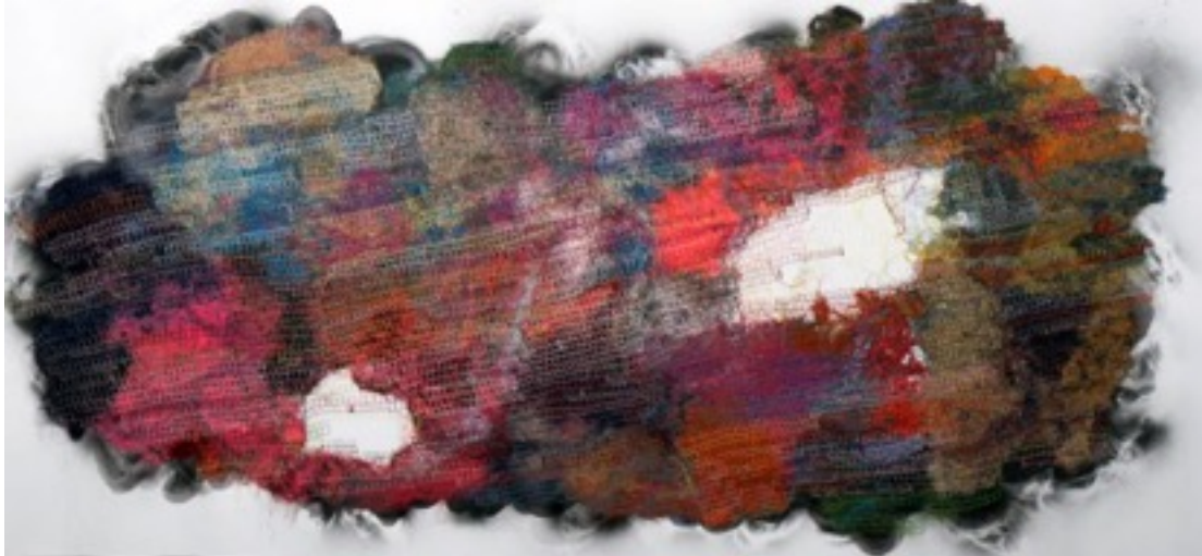
Science des Cartes 05, 2015 - 90 cm x 200 cm, Thread embroidery, color spray on paper