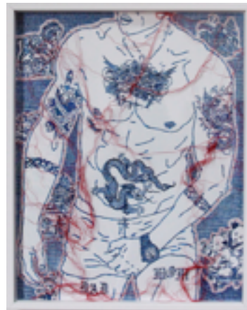
Anne Paris - Cindric LUI II - 2015, ink and silk thread on paper, 40 x 50 cm