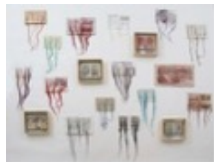
Brankica Zilovic, Totem, 2016, 250 cm x 250 cm, books, embroidery

With Peel Planisphere , once again this paradoxical view of the world map is presented. The idea of salvaging synthetic skins creates an analogy that the world can be reconstructed and reinvented, something that comforts the artist. The map's skin is deliberately peeling, making us question if perhaps our territorial concepts of the world are false.