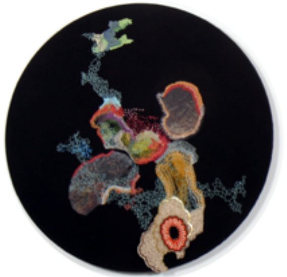
Brankica Zilovic, New scalp 11, 2016, embroidery on canvas, 90 cm

Around drawing, Gallery 2.13, Paris 2012