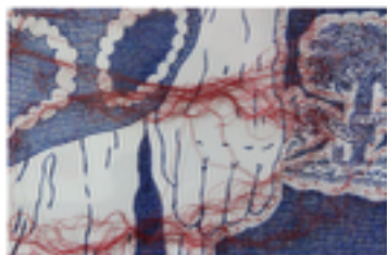
Anne Paris - Cindric LUI detail, 2015 - ink and silk thread on paper 40 x 50 cm