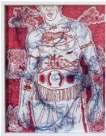
Anne Paris - Cindric LUI VII 2015, ink and silk thread on paper 40 x 50 cm

The use of blue India ink, which draws the tattoos and writes the words on the bodies, makes them appear both desirable and fearsome. The paper, purely white with a delicate grain, is like skin that one can caress. The proliferation of red silk thread that pierces, assembles, irrigates like a reserve of blood, and repairs like medical stitching make these bodies ruined and loved at the same time. A unique story seems to manifest within each work; the threads connect and decorate the surrounding scenes with the tattooed bodies, seeming to create narratives at random.