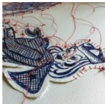
Work's detail of Anne Paris - Cindric for the series of LUI

The use of blue India ink, which draws the tattoos and writes the words on the bodies, makes them appear both desirable and fearsome. The paper, purely white with a delicate grain, is like skin that one can caress. The proliferation of red silk thread that pierces, assembles, irrigates like a reserve of blood, and repairs like medical stitching make these bodies ruined and loved at the same time. A unique story seems to manifest within each work; the threads connect and decorate the surrounding scenes with the tattooed bodies, seeming to create narratives at random.