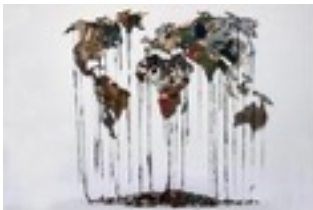
Peel Planisphere, 2016, 200 cm x 250 cm textile, thread, synthetic leader

For this exhibition, Brankica Zilovic presents La Pangée , a mural installation through which the artist proposes a metaphoric vision of the world: both fragile and brutal; a paradox, full of tension, disarticulation, arbitrary borders, and occupied territories. For Zilovic, globalization will never bring about a supercontinent, an obsolete concept of disintegration and dissolution.